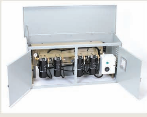
Intelli-Pur™ Protective Enclosure